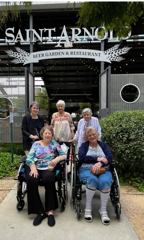
"Squad goals, party pros."